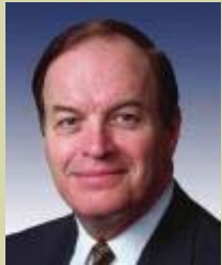
Senator Richard Shelby (R)

326 Russell Senate Office Building Washington, DC 20510 Office: (202) 224-4124 Fax: 202) 224-3149