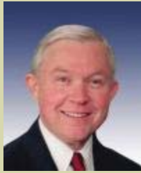
Senator Jeff Sessions (R)

326 Russell Senate Office Building Washington, DC 20510 Office: (202) 224-4124 Fax: 202) 224-3149