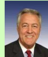
Congressional District 5 Representative Rodney Alexander (R) 316 Cannon HOB Washington, D.C. 20515 Office: (202) 225-8490 Fax: (202) 225-5639