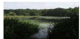
Kisatchie National Forest—LA

Reauthorization of SRSCA is critical for resource constrained rural Louisiana parishes, schools and communities.