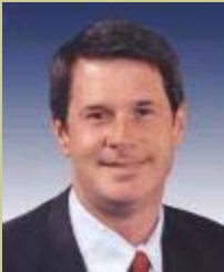
Senator David Vitter (R)

516 Hart Senate Office Building Washington, DC 20510 Office: (202) 224-4623 Fax: (202) 228-5061