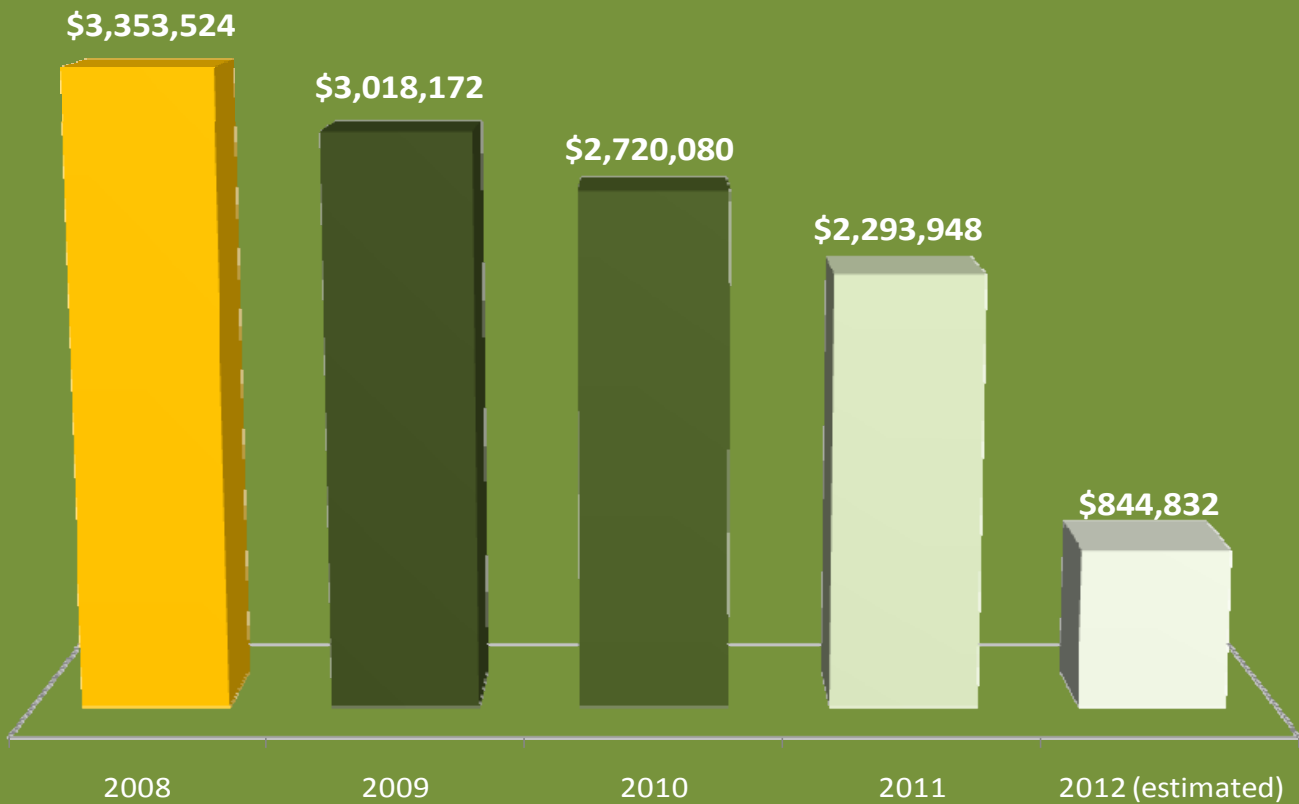
State of Louisiana: Secure Rural Schools & Community Self-Determination Act Receipts