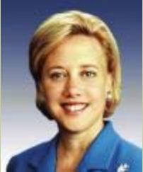
Senator Mary Landrieu (D)

328 Hart Senate Office Building Washington, DC 20510 Office: (202) 224-5824 Fax: (202) 224-9735